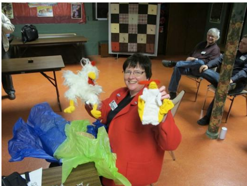
His and Hers