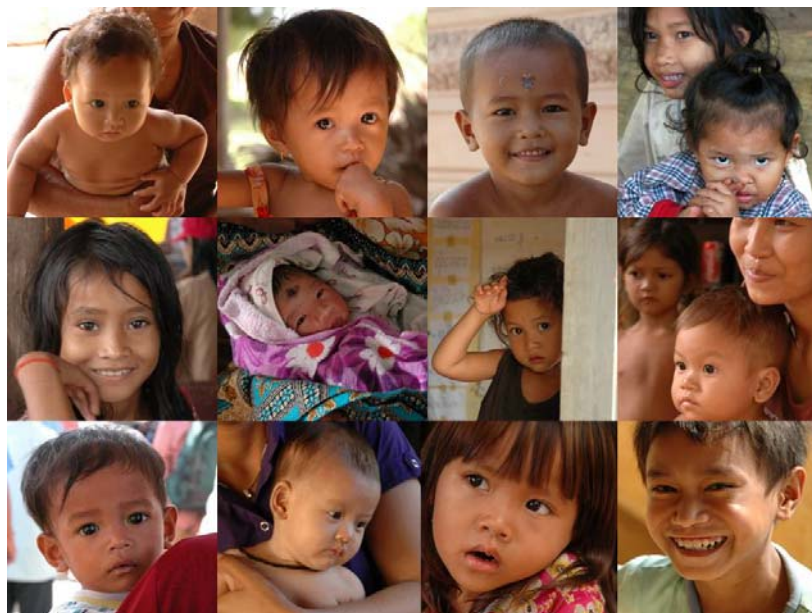
The smiles of children around the world living without tetanus!

June 30 meeting will be a business and board meeting. July 7 meeting will start the summer meetings. If you can host a meeting please contact DP June.