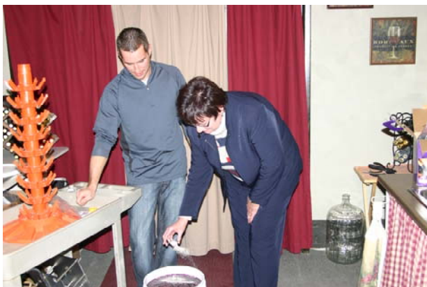
Adding the yeast