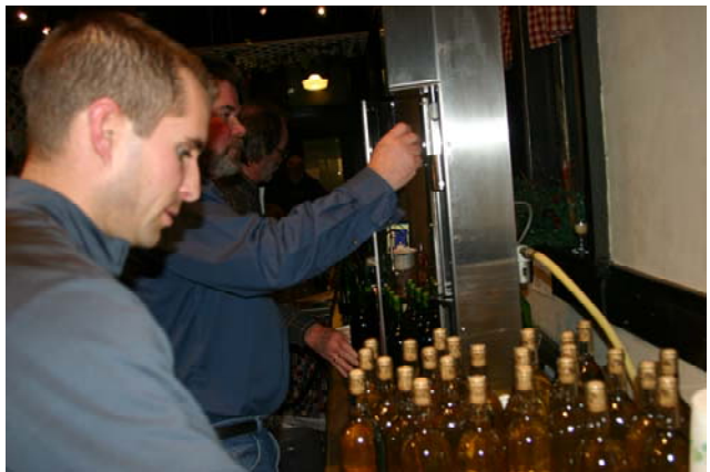
Fill the bottles