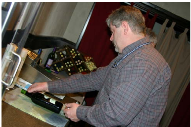
Label the bottles