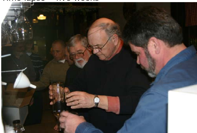
Washing the bottles