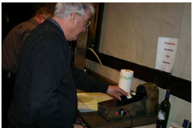
Add the foil tops