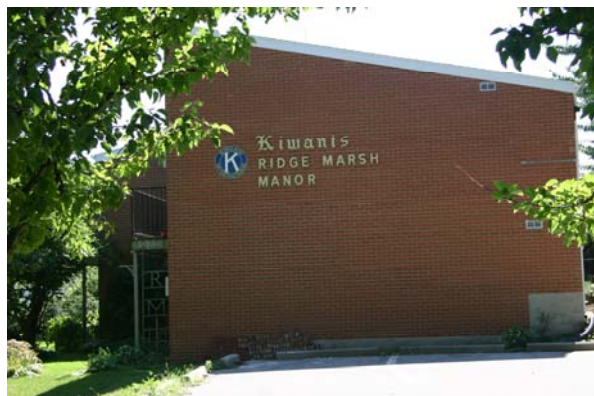
Ridge Marsh Manor

The Kiwanis Club of Ridgetown meets weekly at 6:30 pm in the basement of the Mount Zion Presbyterian Church, 59 Main St. E., Ridgetown, every Thursday, from September 1 st through June 30 th each year. Summer meetings are hosted by members at various local addresses.